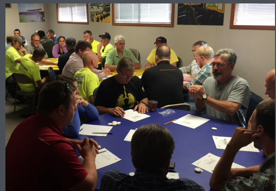
Pull Planning session conducted between the Construction Manager and Subcontractors to collaboratively develop a more Lean, efficient schedule.