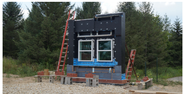
Materials testing mockup. To save on cost and time, smaller mockups of the envelope of a building will be produced to test various flashing, insulation materials, window installations and other variables to ensure proper function. Any issues are then resolved on a smaller scale prior to installation on an entire building. This particular mockup was rigorously tested for flashing installation, brick adherence and appearance, vapor barrier effectiveness and window sealant quality.

How do we really know this works? We measure it. Granger is passionate about measuring and reporting progress on schedule and cost during a project. We believe in a transparent system so every member of the team can see the real status of the job at any time.